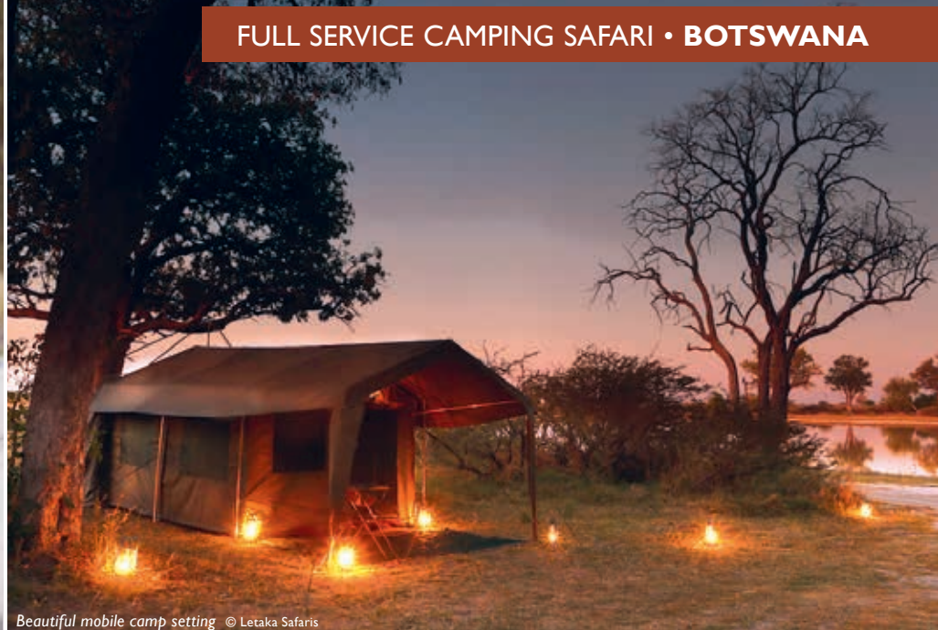
Beautiful mobile camp setting