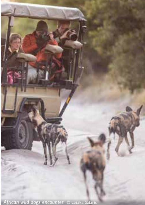
African wild dogs encounter