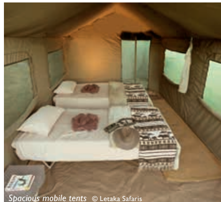
Spacious mobile tents

Fly by light aircraft to Xakanaxa airstrip where you will meet your guide and travel on to your comfortable camp for the next 3 nights. Discover wide open floodplains, lagoons and Mopane woodland on morning and afternoon game drives. Search for lion, elephant, buffalo and the endemic red lechwe antelope. Moremi is one of the best game reserves in Africa for viewing the endangered African wild dog.