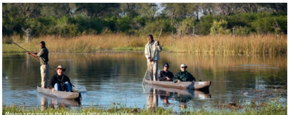
Mokoro experience in the Okavango Delta

Head north-east through the Moremi Game Reserve to the scenic riverbanks of the Khwai River, a mosaic of savanna, camel-thorn woodlands and marshy backwaters. Game drives by day and night are possible in this community area as well as explorations of the surrounding wilderness by mokoro (traditional dugout canoe).