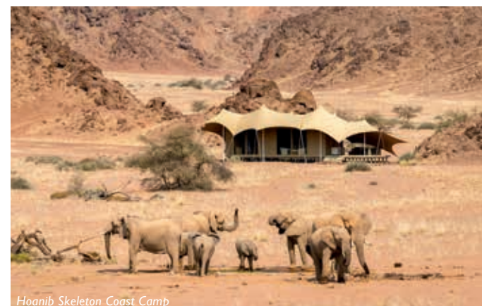
Hoanib Skeleton Coast Camp

HOANIB SKELETON COAST CAMP 4 days/3 nights from $7032 per person twin share*