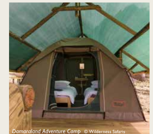
Damaraland Adventure Camp

Continue via Cape Cross to Damaraland Adventurer Camp. Enjoy day and night nature walks, viewing the rock engravings at Twyfelfontein and game drives. BLD