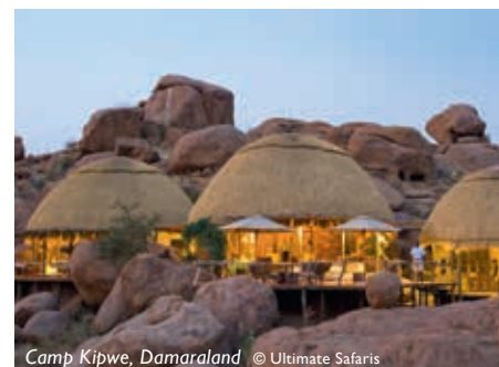
Camp Kipwe, Damaraland

Drive through a vast landscape of magnificent mountains, rock formations and unique vegetation to Damaraland. Visit the prehistoric Twyfelfontein rock engravings, the Organ Pipes geological site and enjoy a game drive in search of the unique desert adapted elephant. Overnight at Camp Kipwe. BLD