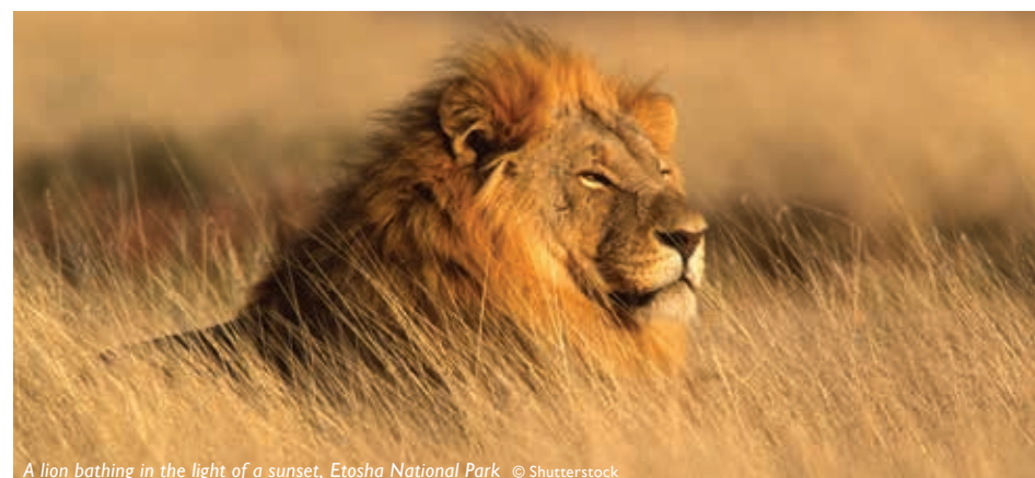
A lion bathing in the light of a sunset, Etosha National Park

T ravelling by road to some of the country's most renowned scenic and wildlife locations, this small group tour offers a very personal journey through Namibia. Staying in very comfortable lodges and tented camps, the Ultimate Namibia Safari is accompanied by a professional and experienced naturalist guide. Highlights include the world's highest sand dunes at Sossusvlei, sea kayaking with seals and dolphins on the Skeleton Coast, tracking desert-adapted elephants and wildlife viewing in the famous Etosha National Park. The safari