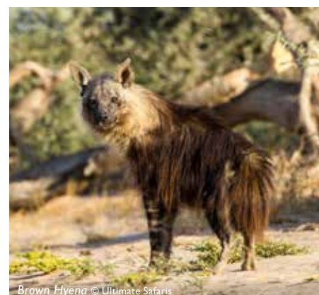
Brown Hyena