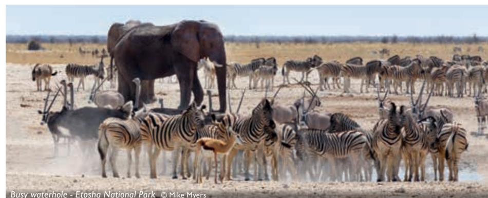
Busy waterhole - Etosha National Park © Mike Myers