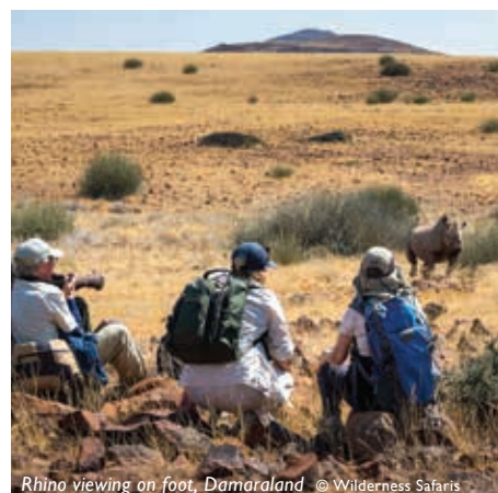
Rhino viewing on foot, Damaraland