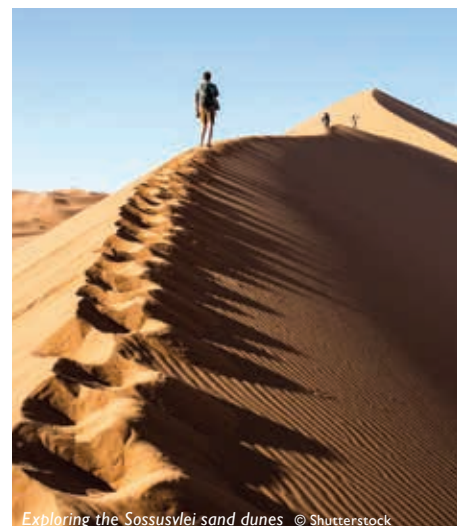
Exploring the Sossusvlei sand dunes

D iscover the breathtaking beauty of the Namib Desert from the air with this flying safari. Designed to offer you some of the best camps and wilderness areas in the country, this safari will take you on an unforgettable African journey.