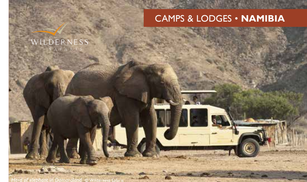
Herd of elephant in Damaraland