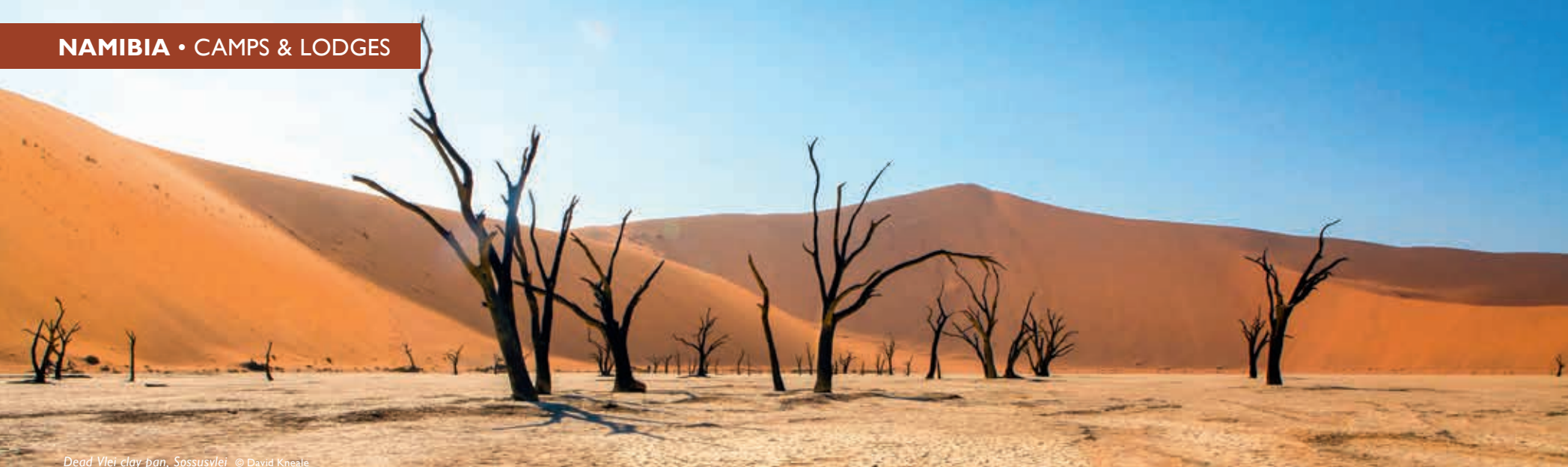
Dead Vlei clay pan, Sossusvlei