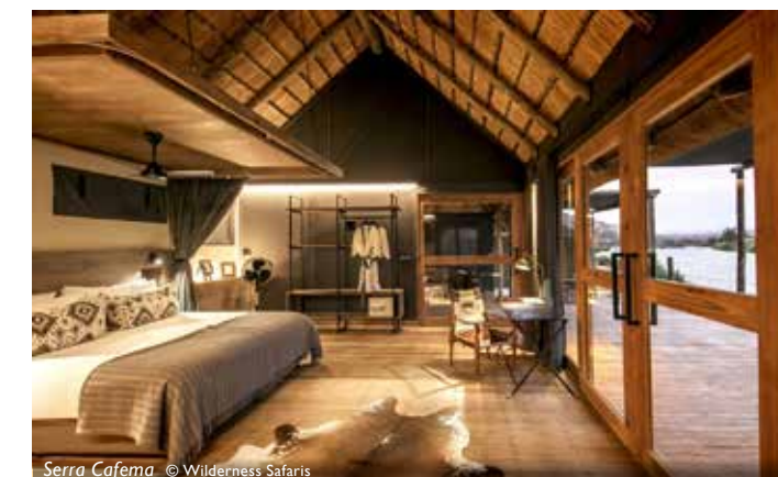
Serra Cafema

SERRA CAFEMA 4 days/3 nights from $7661 per person twin share*