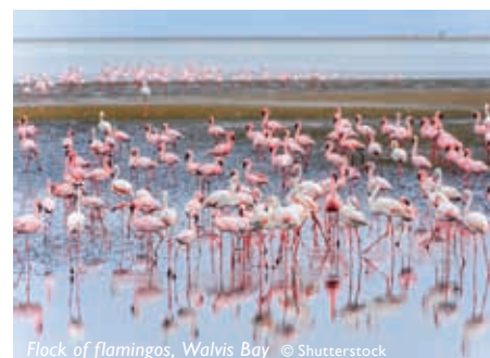
Flock of flamingos, Walvis Bay

Depart Windhoek early morning by road for Sossusvlei arriving at Sossus Dune Lodge mid-afternoon. Time permitting, visit nearby Sesriem Canyon or explore Elim Dune. On Day 2 enjoy a sunrise tour of the magnificent sand dunes before returning to the lodge for lunch. Afternoon at leisure. LD/BLD