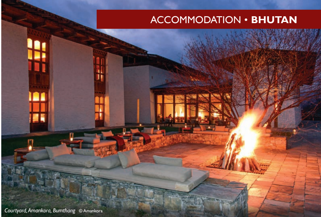
Courtyard, Amankora, Bumthang

With a number of international hotel companies now operating in Bhutan there is a wide choice of accommodation, from cosy Bhutanese guesthouses to luxurious resorts. Together with our operator, we have carefully selected government approved accommodations with the best location, service, ambience and cuisine. Our standard range of hotels and guesthouses (listed as Category C) are clean, comfortable, simply furnished and generally rated 'tourist class'. For those travellers who prefer a higher level of comfort we offer a range of superior, deluxe hotels (Category B), as well as luxurious lodges and resorts with spa and yoga facilities (listed as Category A). We can mix and match accommodation types to suit your itinerary and budget, complementing your style of travel. It is important to note that during festivals hotels/ lodges are in high demand and accommodation can be difficult to secure.