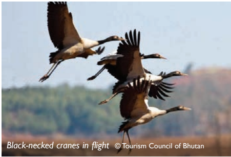
Black-necked cranes in flight

PHUENTSHOLING The bustling frontier trading town of Phuentsholing in the south is the gateway to Bhutan for overland travellers from India and Sikkim. From Phuentsholing, the road winds north over the southern foothills, through lush forested valleys and around the rugged north-south ridges of the inner Himalayas to the western valleys of Thimphu and Paro.