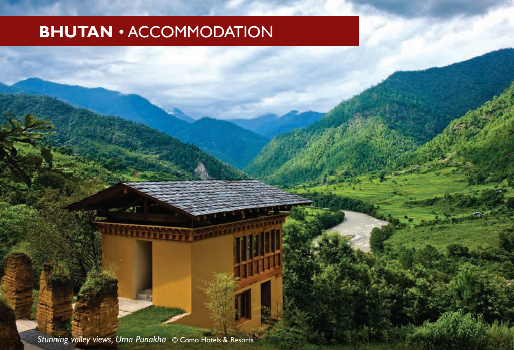
Stunning valley views, Uma Punakha