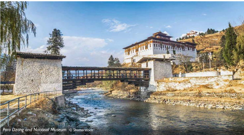
Paro Dzong and National Museum

Day 7 Tour ends Paro Early morning transfer to airport for your onward flight. Tour ends. B