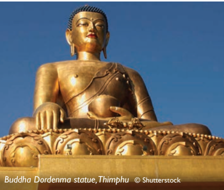
Buddha Dordenma statue, Thimphu

Explore Thimphu's many highlights including the Buddha Dordenma statue, the Memorial Chorten and Tashichhodzong. On Day 3 enjoy a hike through forested hills to Tango Monastery. BLD