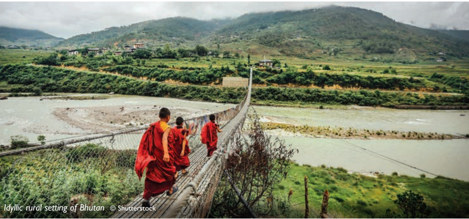
Idyllic rural setting of Bhutan

PUNAKHA Punakha (1,310m) is Bhutan's ancient capital and the winter seat of the Central Monastic Body due to its sub-tropical climate. The Punakha Dzong, built in 1637 by the Shabdrung (the unifier of Bhutan), is situated on a triangular spit of land at the confluence of two rivers. The body of the Shabdrung, who died in 1651, is entombed at the Dzong. Its main temple is breathtaking with four intricately embossed entrance pillars crafted from cypress and decorated in gold and silver. Other highlights include the incredible sweeping valley views from Khamsum Yuelley Namgyal Chorten and Chimi Lhakhang, dedicated to Bhutan's popular saint Drukpa Kuenley, otherwise known as the "divine madman" due to his unorthodox methods of religious teaching.