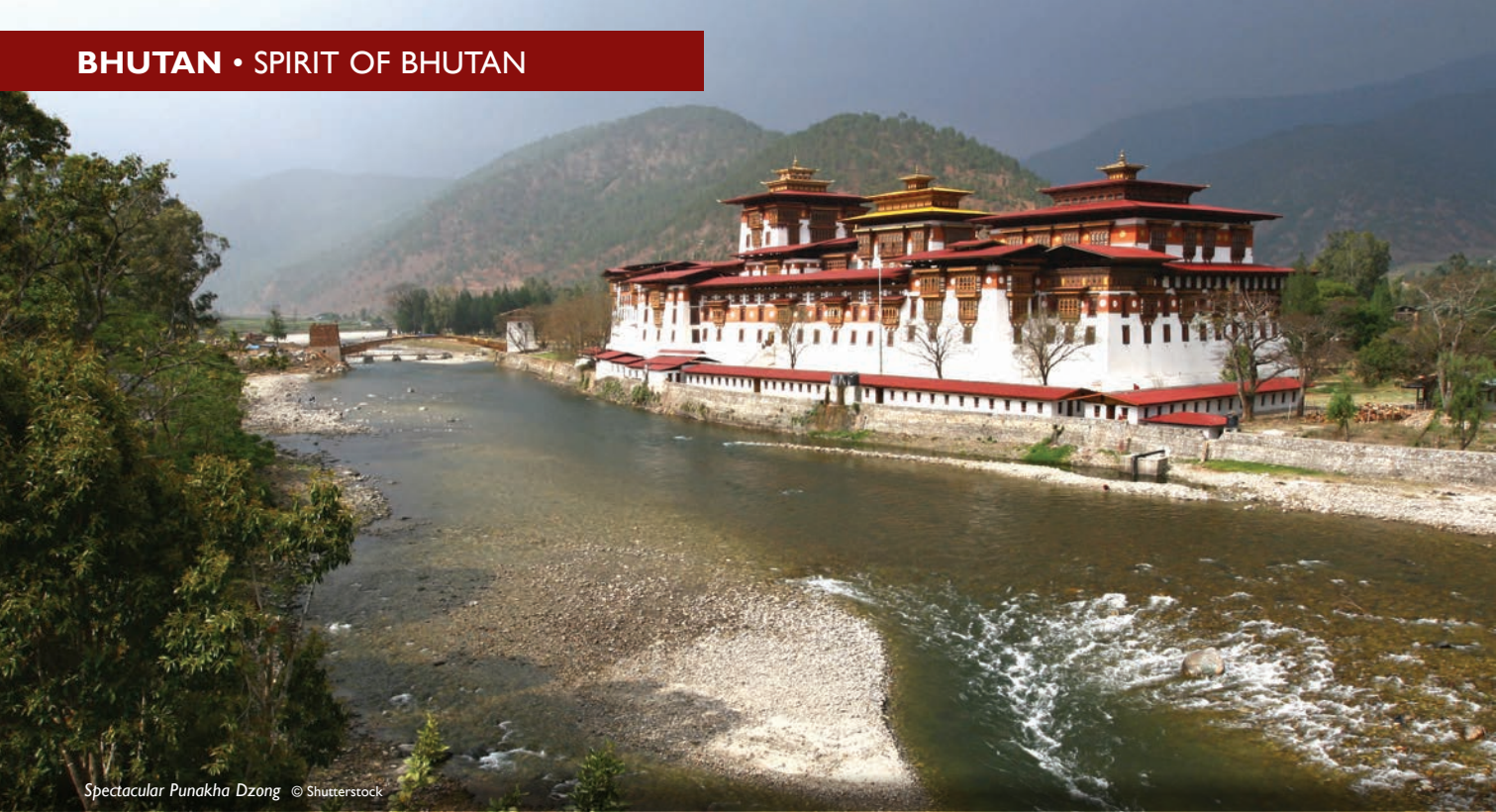
Spectacular Punakha Dzong

8 days/7 nights From $2834 per person twin share Departs daily ex Paro