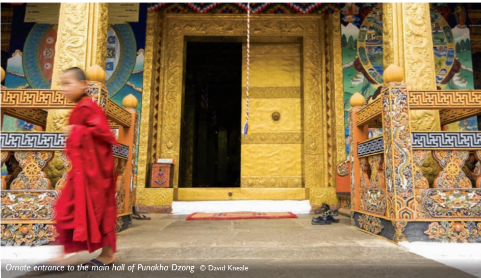
Ornate entrance to the main hall of Punakha Dzong © David Kneale