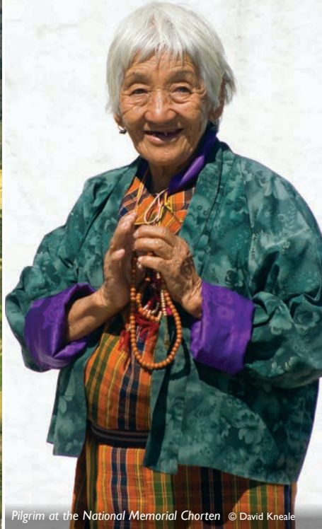
Pilgrim at the National Memorial Chorten