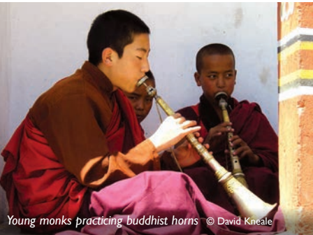
Young monks practicing Buddhist horns

Early morning transfer to the airport for your onward flight. Tour ends. B