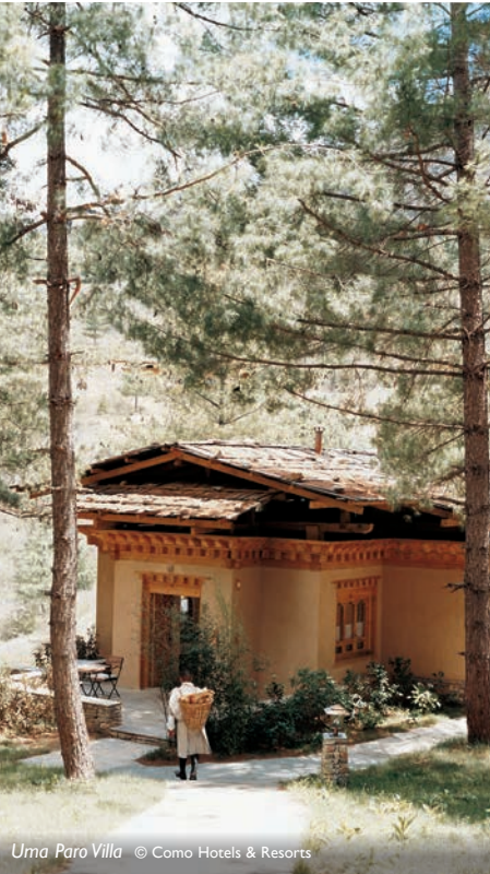
Uma Paro Villa

With a number of international hotel companies now operating in Bhutan there is a wide choice of accommodation, from cosy Bhutanese guesthouses to luxurious resorts. Together with our operator, we have carefully selected government approved accommodations with the best location, service, ambience and cuisine. Our standard range of hotels and guesthouses (listed as Category C) are clean, comfortable, simply furnished and generally rated 'tourist class'. For those travellers who prefer a higher level of comfort we offer a range of superior, deluxe hotels (Category B), as well as luxurious lodges and resorts with spa and yoga facilities (listed as Category A). We can mix and match accommodation types to suit your itinerary and budget, complementing your style of travel. It is important to note that during festivals hotels/ lodges are in high demand and accommodation can be difficult to secure.