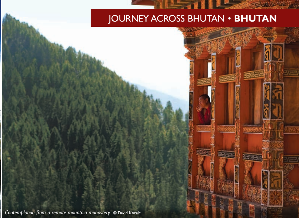
Contemplation from a remote mountain monastery

7 days/6 nights From $2541 per person twin share Departs daily ex Siliguri or Bagdogra