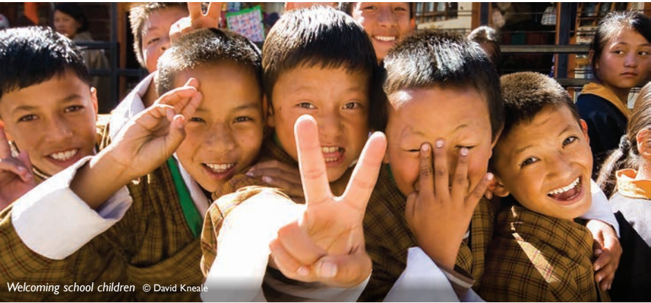
Welcoming school children

BUMTHANG Bumthang is the spiritual heartland of Bhutan. It is distinguished in history as the first place Buddhism was introduced to Bhutan by Guru Rimpoche. Its undulating green valleys are renowned for their natural beauty, historic palaces and many of Bhutan's oldest temples and monasteries. Some of these include Kurje Lhakhang, home to a rock featuring the imprint of Guru Rimpoche's body, 7th century Jambay Lhakhang and the Tamshing Monastery containing some of the oldest wall paintings in Bhutan. Tales of Guru Rimpoche and the tertons ('religious treasure-discoverers') linger throughout this sacred region. Another highlight is Ugyenchholing Palace, an exquisite private mansion housing a small eco-museum.