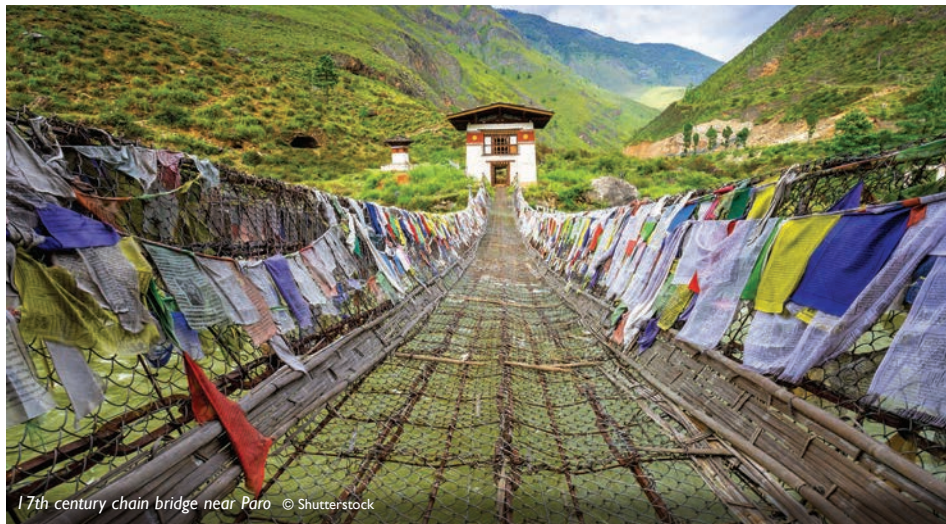
17th century chain bridge near Paro

This comprehensive tour is designed for those who want to gain a deeper insight into Bhutan's culture and its stunning and varied landscapes. It begins in the gentle valleys of the west, crossing spiritual central Bhutan before exploring the historical towns of Mongar and Trashigang in the rugged east.