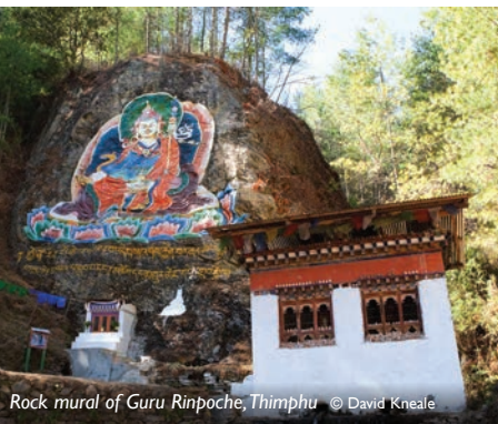
Rock mural of Guru Rinpoche, Thimphu

Drive to Punakha (3 hrs) via Dochula Pass. Spend two days exploring. Tour Chimi Lhakhang and Punakha Dzong, and take a short hike to Khamsum Yulley Namgyal Chorten. BLD