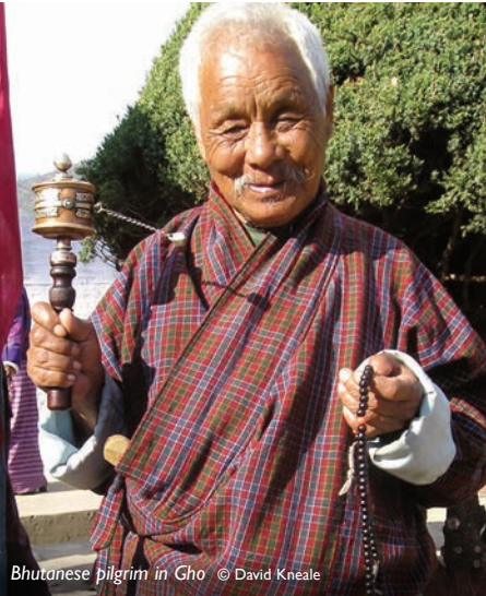
Bhutanese pilgrim in Gho

Discover the uniquely preserved culture and natural beauty of the kingdom of Bhutan. Touring the western valleys, you will discover historic fortresses, ancient monasteries and ornate temples set against a dramatic Himalayan backdrop.