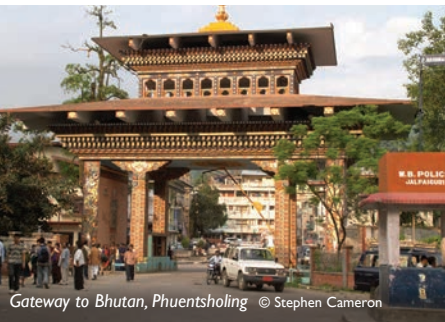
Gateway to Bhutan, Phuentsholing

Day 1 Phuentsholing A representative will meet you on arrival at either Siliguri or Bagdogra airport in the Indian state of West Bengal. Travel by road (approx 3 hrs) through green tea estates to Phuentsholing, the gateway to Bhutan, for dinner and overnight. LD