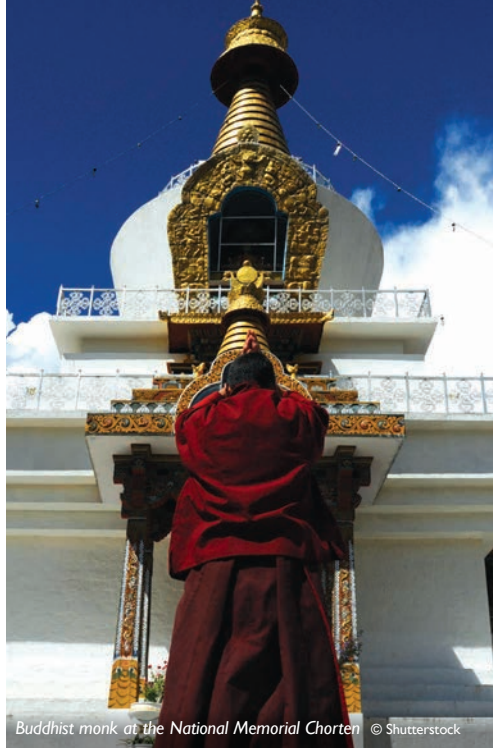
Buddhist monk at the National Memorial Chorten