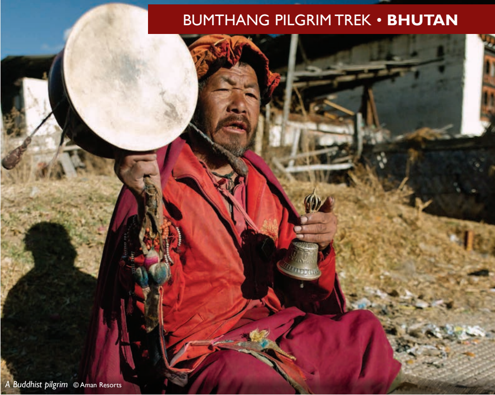
A Buddhist pilgrim

Day 5 Bumthang Early morning visit to Trongsa Dzong and then drive to Bumthang (3 hrs). Spend the afternoon exploring ancient monasteries and sacred sites, some dating back to the 7th century. BLD Day 6 Bumthang Ngang Lhakhang (14km, 3-4 hrs) Today with your guide, you will begin your 3 day trek. The walking route follows the Chamkhar River through open fields and pine forests. The trail is at a leisurely pace with plenty of time to stop at local villages and temples. Overnight in local farmhouse. Altitude 2,900m. BLD Day 7 Nang Lhakhang Ugyencholing (19km, 7-8 hrs) A full day's trek ascending gradually through the forest towards Phephe La Pass (3,360m) before descending into the Tang Valley, finally arriving at the village of Ugyencholing (2,850m). Overnight in guesthouse. Altitude 2,670m. BLD Day 8 Ugyencholing Bumthang (11km, 4 hrs) Walk up to Ugyencholing Palace, a beautiful mansion housing a small eco-museum. Later, travel back by vehicle to Bumthang, stopping at the Burning Lake where religious treasures were found in the 15th century. Overnight in Bumthang. BLD