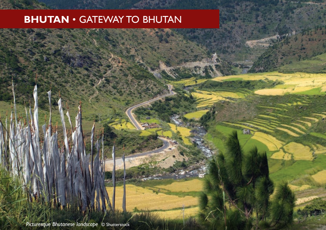
Picturesque Bhutanese landscape