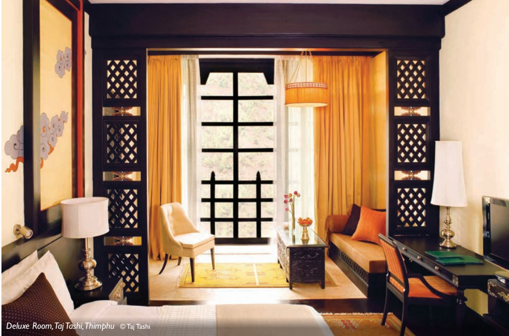
Deluxe Room, Taj Tashi, Thimphu