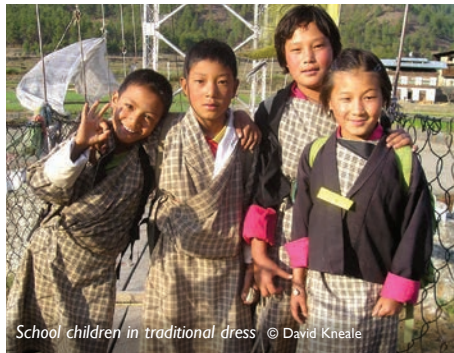
School children in traditional dress

Days 9/10 Bumthang Drive to Bhutan's spiritual heartland, the Bumthang Valley (2.5 hrs), through forests and stunning mountain passes. See highlights including Kurje Lhakhang containing a rock imprint of Guru Rimpoche's body, Jambay Lhakhang, one of the oldest temples in Bhutan and Tamshing Lhakhang containing ancient Buddhist wall paintings. BLD