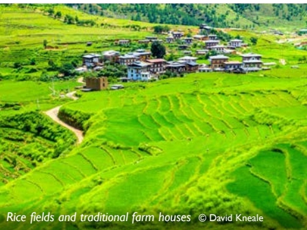
Rice fields and traditional farm houses