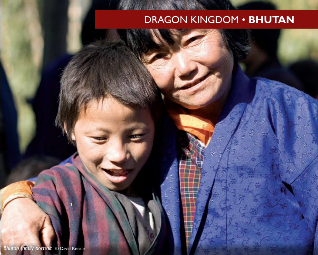
Bhutan family portrait

Drive to Punakha (3 hrs) via Dochula Pass. Spend two days exploring. Tour Chimi Lhakhang and Punakha Dzong, and take a short hike to Khamsum Yulley Namgyal Chorten. BLD