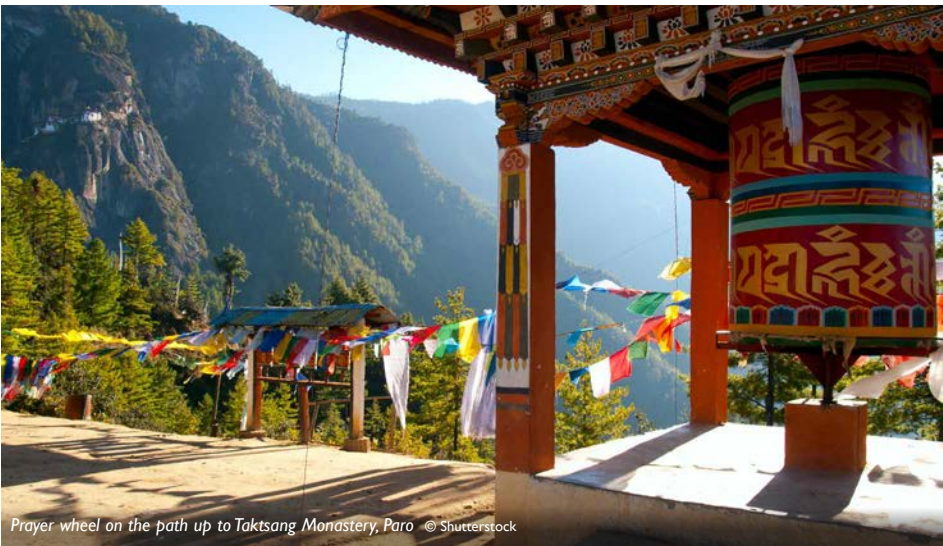
Prayer wheel on the path up to Taksang Monastery, Paro

Drive to Punakha (3 hrs) via Dochula Pass (3,050m) with its amazing Himalayan views (weather permitting). Afternoon visit to Punakha Dzong, built in 1637. On Day 5 visit Chimi Lhakhang, temple of the 'Divine Madman' followed by a hike through beautiful farmland to Khamsum Yulley Namgyal Chorten with its complex Nyingmapa iconography and sweeping valley views from its rooftop. BLD