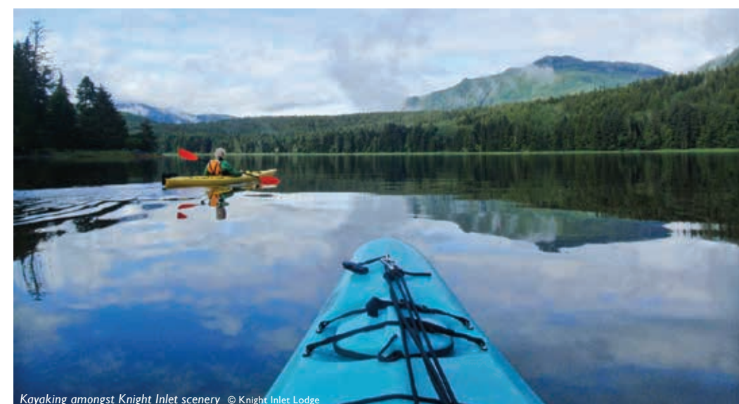
Kayaking amongst Knight Inlet scenery