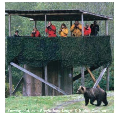
Viewing platform, Knight Inlet Lodge