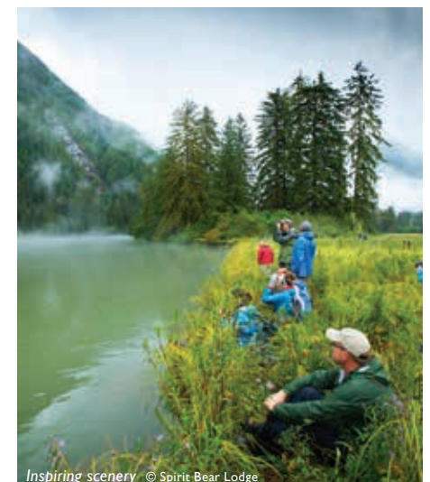
Inspiring scenery