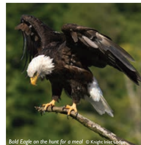
Bald Eagle on the hunt for a meal