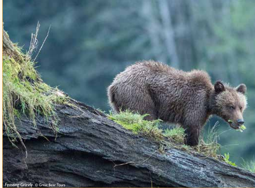
Feasting Grizzly