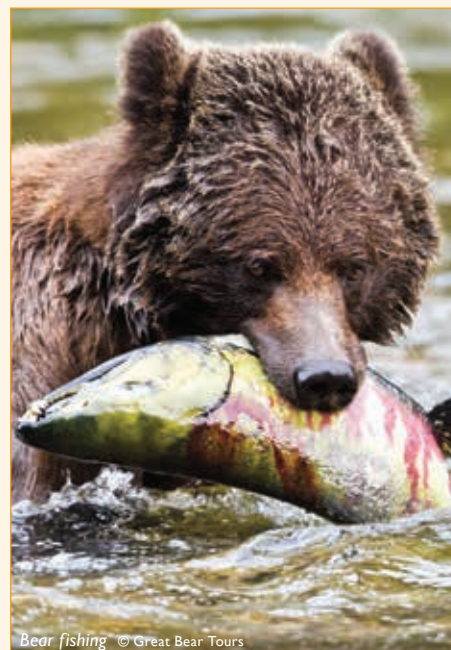
Bear fishing

Ground transportation from Port Hardy Airport or hotel to seaplane base on arrival & departure day, seaplane flight to/from lodge, full board, complimentary wine & beer, activities at Great Bear Nature Tours' lodge, protective rainwear, rubber boots, BC Conservation Licensing fee, Grizzly Bear Research Contribution & staff gratuity.