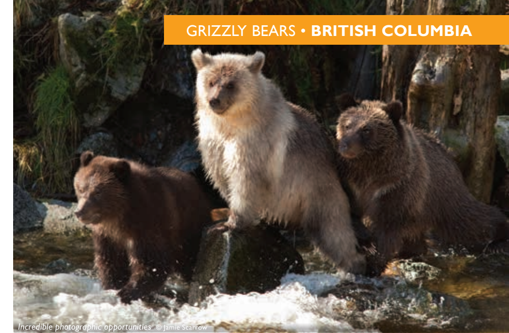
Incredible photographic opportunities