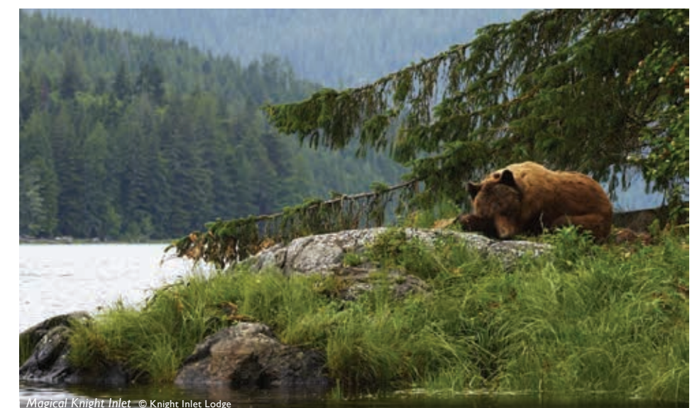
Magical Knight Inlet