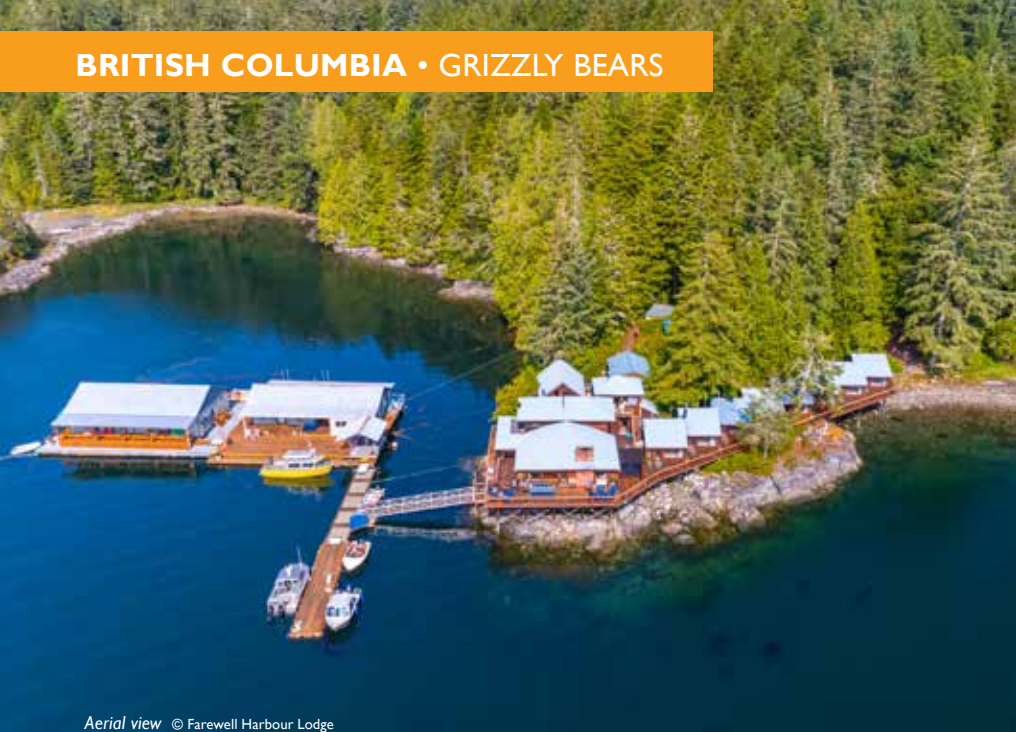
Aerial view