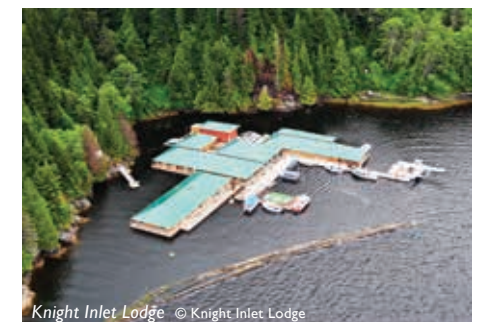
Knight Inlet Lodge