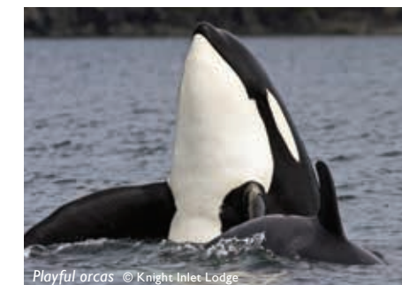
Playful orcas