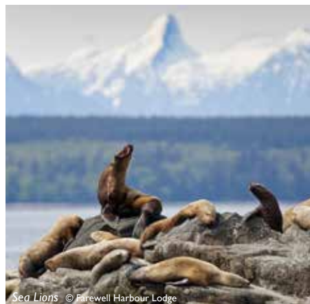
Sea Lions

Day 5 Tour ends Alder Bay Enjoy a final morning activity before returning by water taxi to Alder Bay. Tour ends.