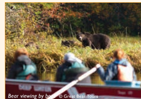
Bear viewing by boat

Day 4 Tour ends Port Hardy Transfer by float plane to Port Hardy. Tour ends.