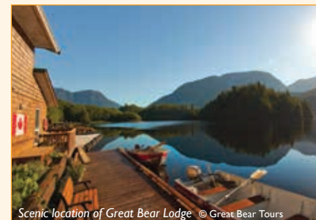
Scenic location of Great Bear Lodge