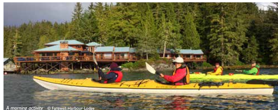
A morning activity