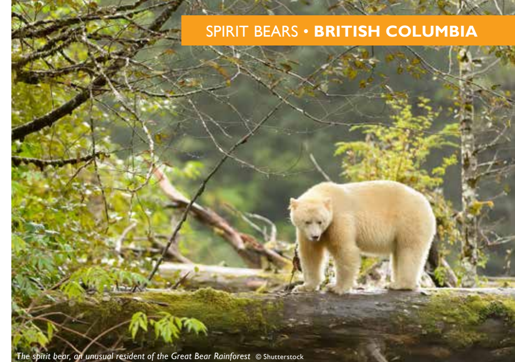
The spirit bear, an unusual resident of the Great Bear Rainforest