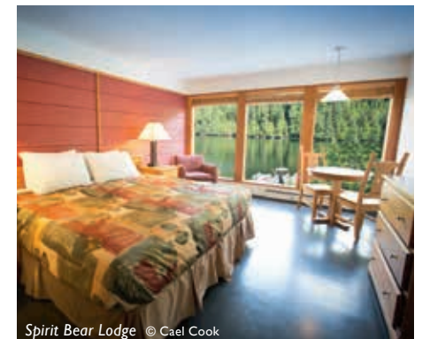
Spirit Bear Lodge

Day 5 Tour ends Vancouver Enjoy a morning tour before transferring back to Bella Bella to catch the afternoon flight to Vancouver. Tour ends.