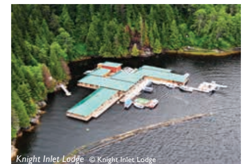
Knight Inlet Lodge