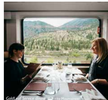
GoldLeaf Service dining

This tour also operates in reverse order.