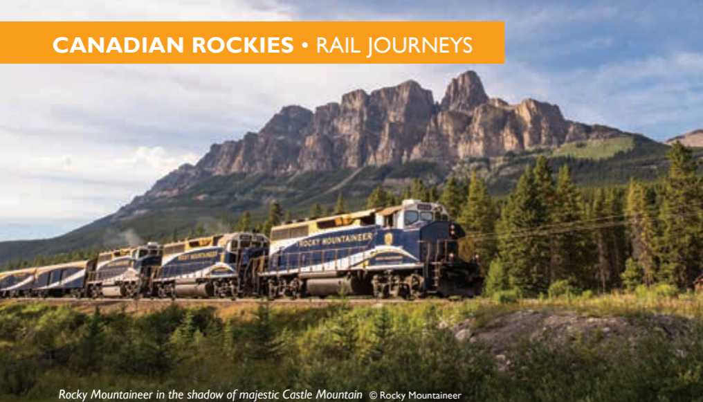
Rocky Mountaineer in the shadow of majestic Castle Mountain