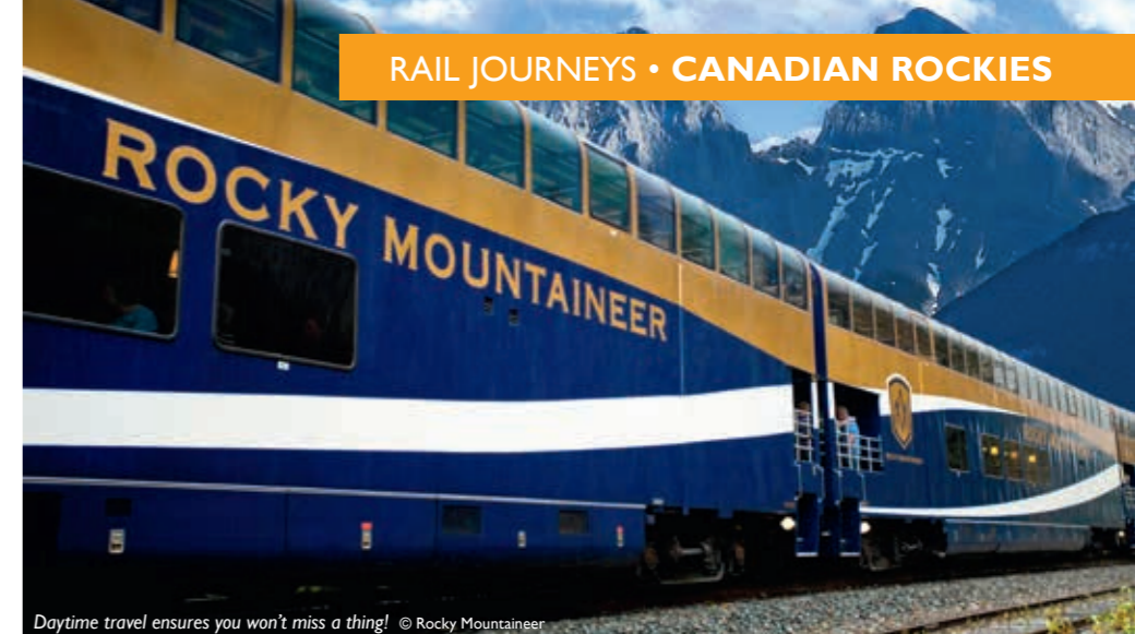
Daytime travel ensures you won't miss a thing!

This tour also operates in reverse order.