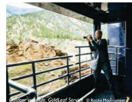
Outdoor verandah, GoldLeaf Service

Combine two days travel aboard the Rocky Mountaineer with a leisurely self-drive through picturesque countryside. Visit Yoho National Park, Lake Louise, Jasper and Bow Summit.