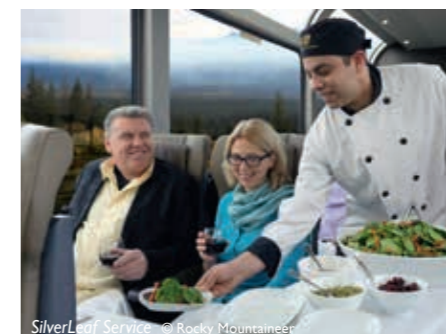
SilverLeaf Service

For further information please contact Natural Focus on (03) 9249 3777 or 1300 363 302 or info@awsnfs.com