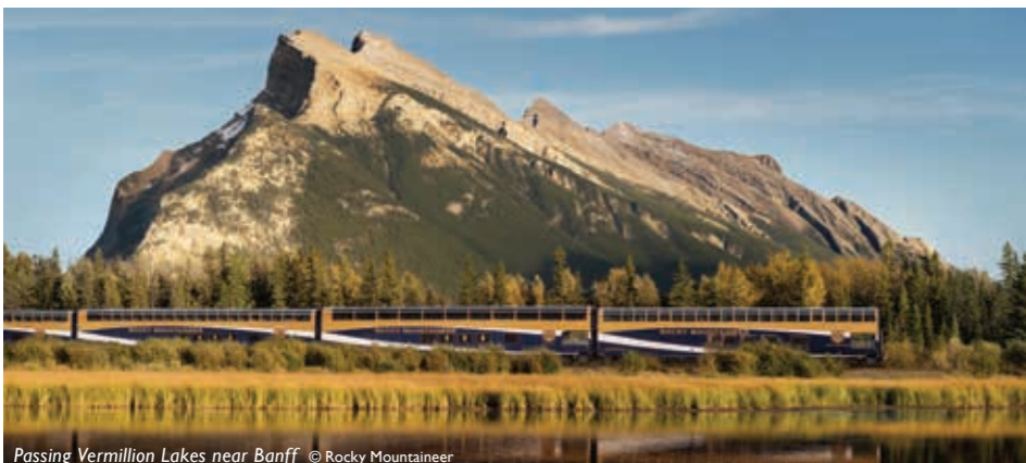
Passing Vermillion Lakes near Banff