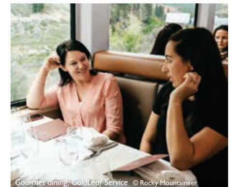
Gourmet dining, GoldLeaf Service

This morning explore beautiful Lake Louise. In the afternoon enjoy a half-day tour of Yoho National Park, home to wonders such as Emerald Lake. Continue on to Lake Louise with the remainder of the day at leisure. Overnight in Lake Louise.