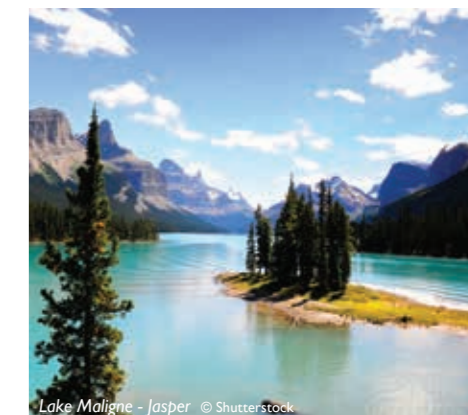
Lake Maligne - Jasper

Drop off your rental car in downtown or at the Airport. Tour ends.