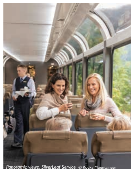
Panoramic views, SilverLeaf Service

Explore the magnificent scenery of British Columbia and Alberta onboard the famous Rocky Mountaineer train. Travel past snowy mountain peaks, shimmering glacial lakes, towering waterfalls and ancient forests. You can experience all this from the comfort of Rocky Mountaineer's glass-dome coaches. Choose from the luxurious GoldLeaf Service with its bi-level glass-dome coach and exclusive gourmet dining room, or SilverLeaf Service with its single-level dome coach and meals plated to your preference at your seat. Each service level features extended leg room and is temperature controlled for optimum comfort. All journeys take place in daylight only, so you won't miss a minute of the diverse beauty and awe-inspiring scenery of Canada's West.