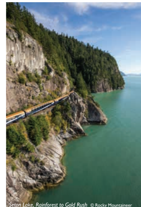
Seton Lake, Rainforest to Gold Rush

These tours also operate in reverse order.