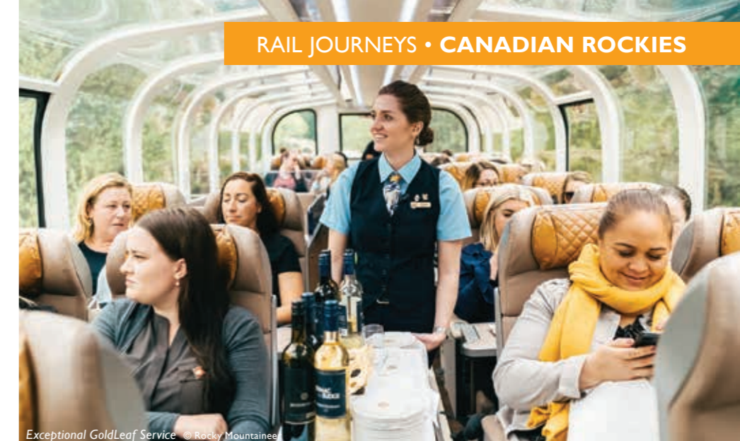
Exceptional GoldLeaf Service