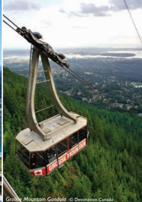
Grouse Mountain Gondola