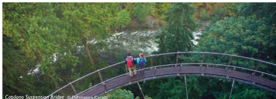
Capilano Suspension Bridge

A landmark since the Roaring Twenties, this exquisitely restored downtown property is one of Vancouver's grandest hotels. Nestled within the heritage exterior are 156 ultra-chic guestrooms with spa-inspired bathrooms, a saltwater lap pool, day spa and fitness centre.