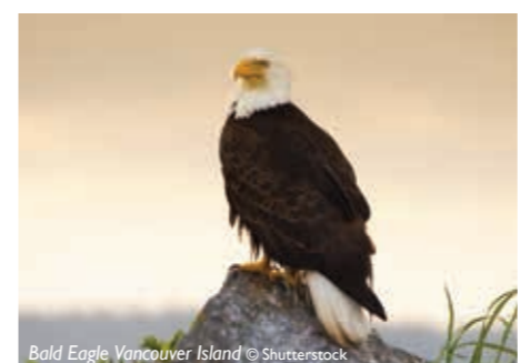
Bald Eagle Vancouver Island