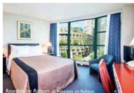
Rosedale on Robson

This modern hotel offers breathtaking views of Vancouver's Harbour, mountains and city skyline and is situated beside the Canada Place Cruise Ship Terminal. It features 489 contemporary rooms, an outdoor pool overlooking the harbour, a restaurant, cafe, bar, rooftop garden and gym.