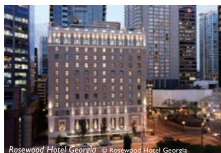
Rosewood Hotel Georgia

Offering sweeping views of the surrounding mountains and harbour, the prestigious Fairmont Pacific Rim Hotel has prime access to Vancouver's cruise ship terminal and the city's best shopping and dining areas. The 367 elegant guest rooms and suites feature Italian linens and marble bathrooms.