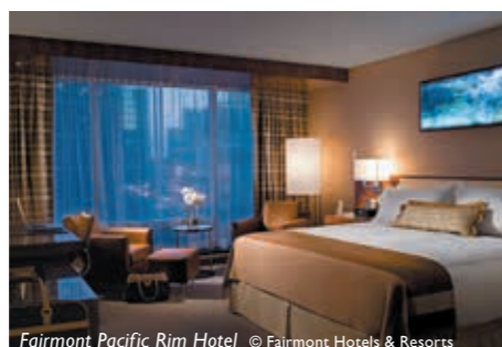
Fairmont Pacific Rim Hotel

Further details for all tours on request.