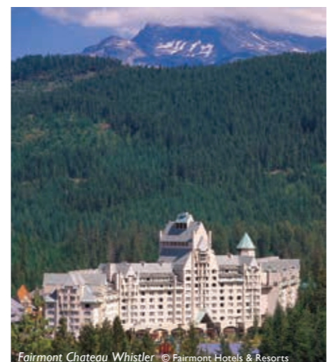
Fairmont Chateau Whistler

Departure transfer to downtown Vancouver.