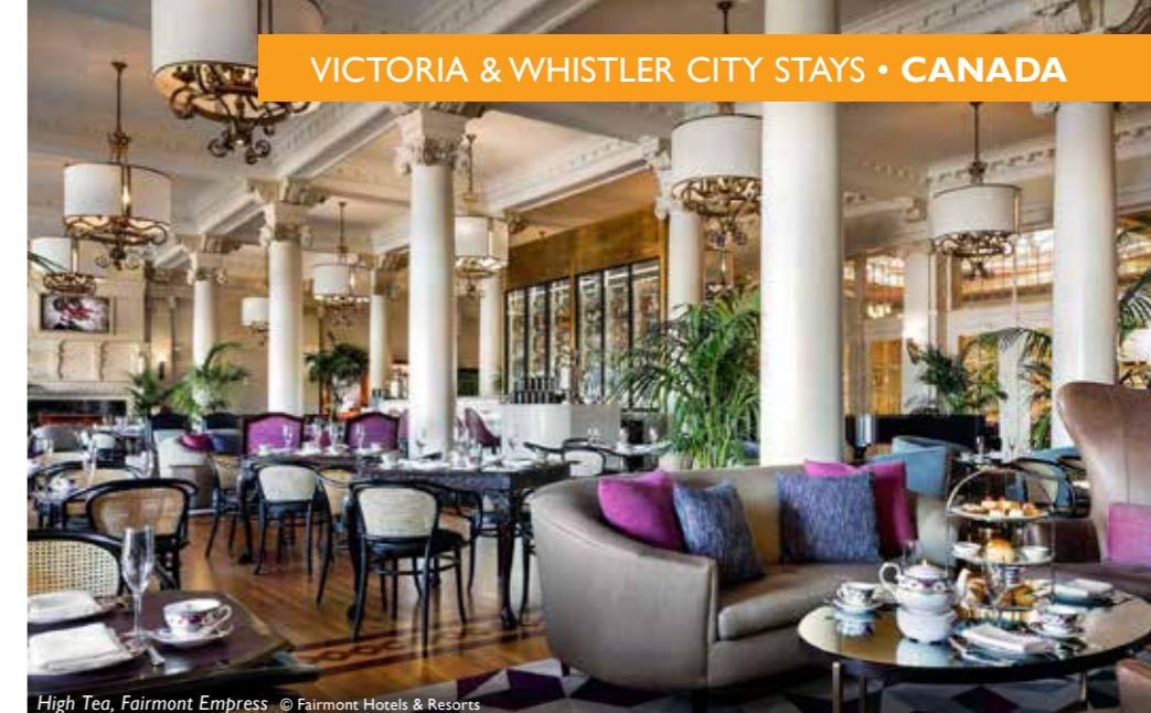
High Tea, Fairmont Empress