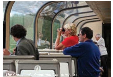
The Canadian's Panorama Car