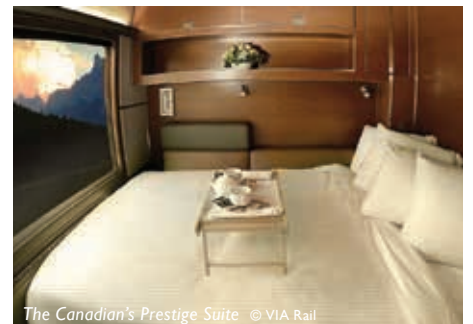
The Canadian's Prestige Suite