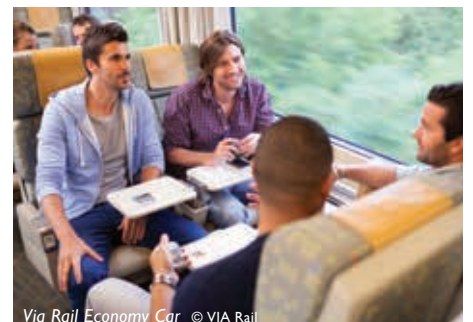
Via Rail Economy Car