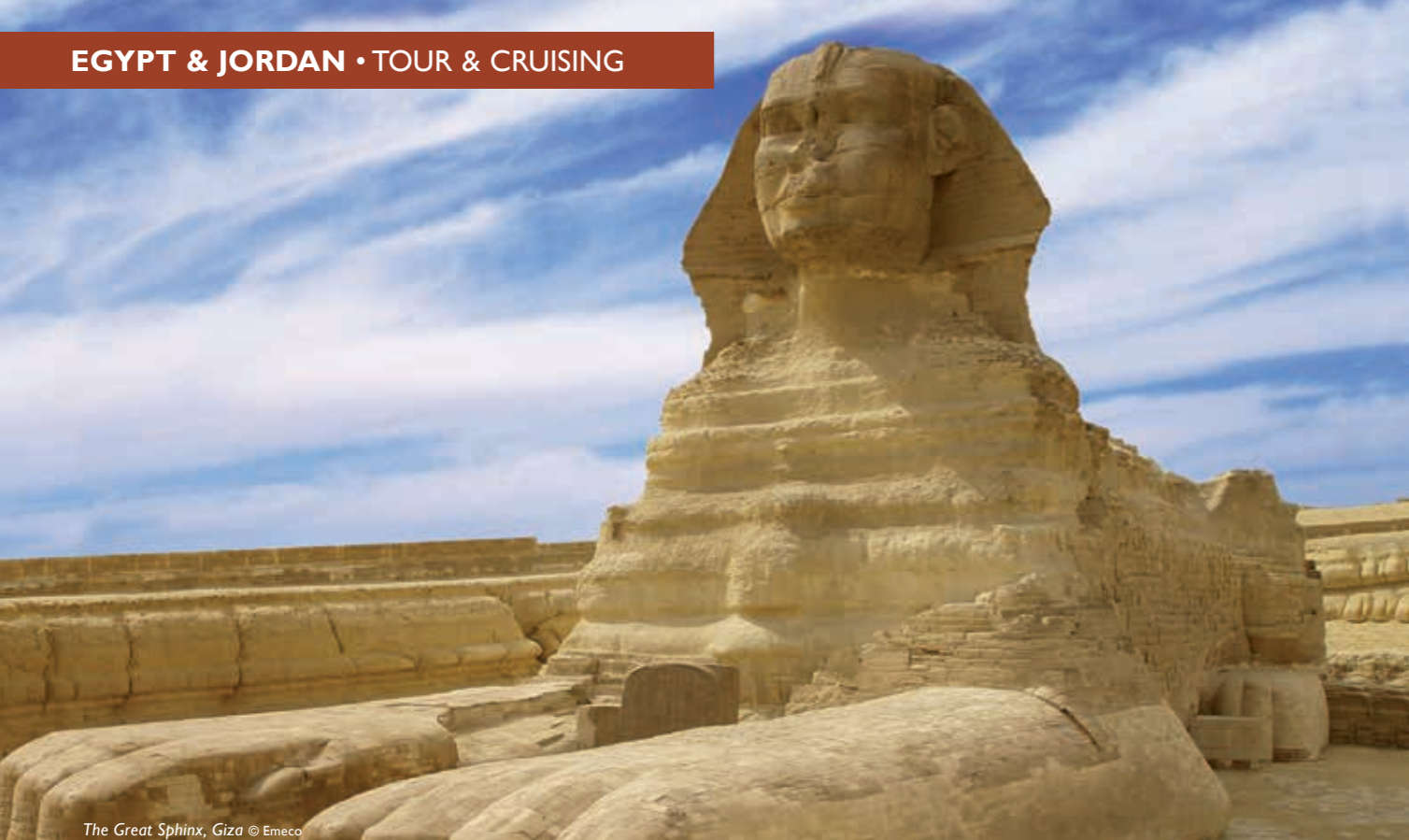
The Great Sphinx, Giza