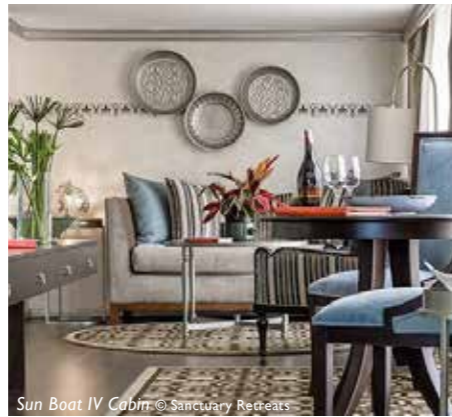
Sun Boat IV Cabin