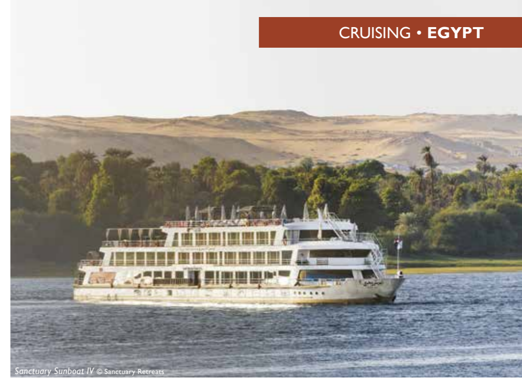
Sanctuary Sunboat IV

We have a wide range of hotels and cruise boats to choose from and can mix & match in order to suit your travelling budget.