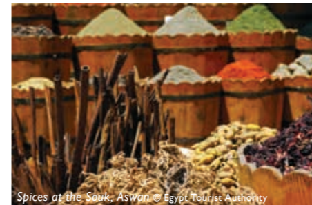
Spices at the Souk, Aswan