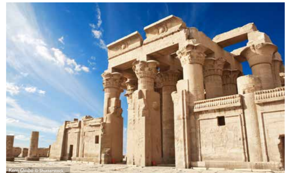
Kom Ombo