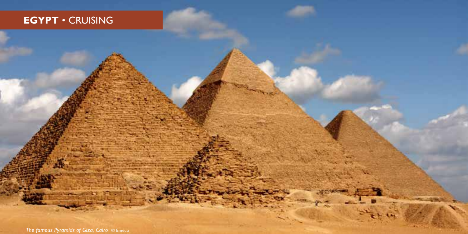
The famous Pyramids of Giza, Cairo