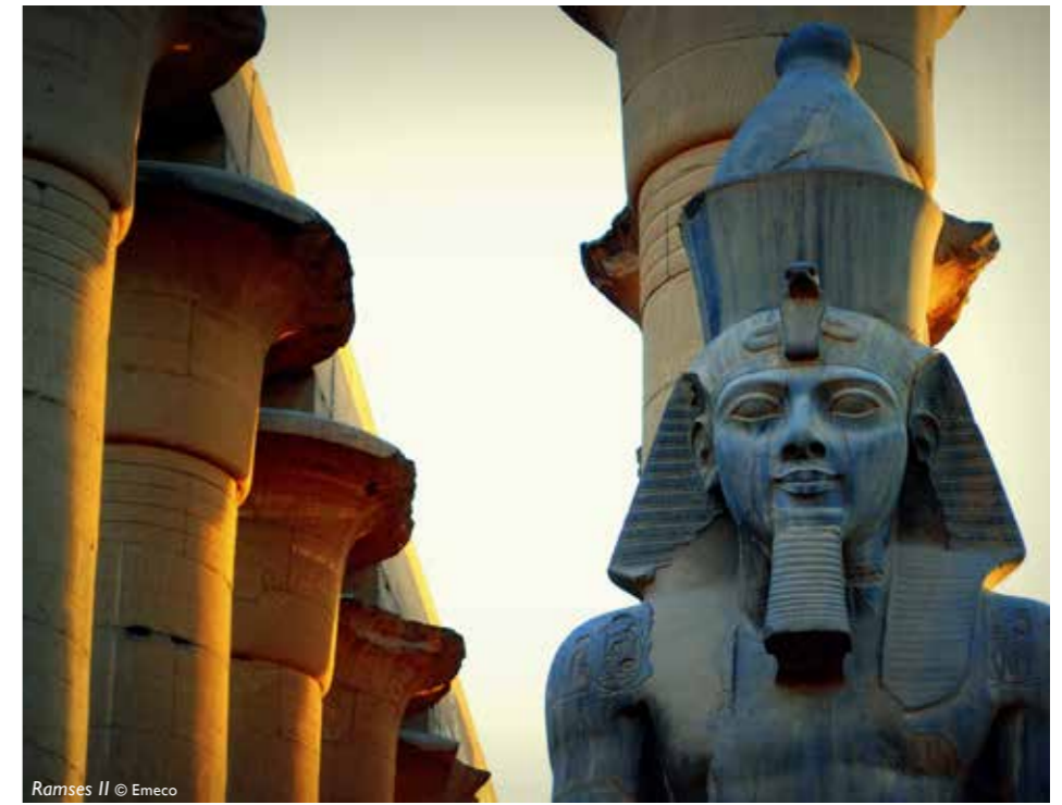
Ramses II © Emeco