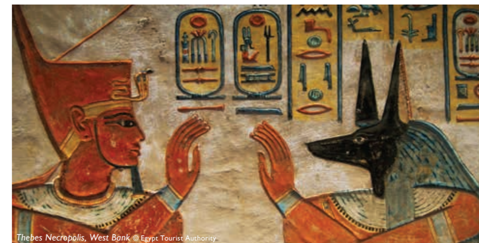
Thebes Necropolis, West Bank

Day 15 Tour Ends Amman Morning at leisure before you transfer to Amman where your tour ends. B