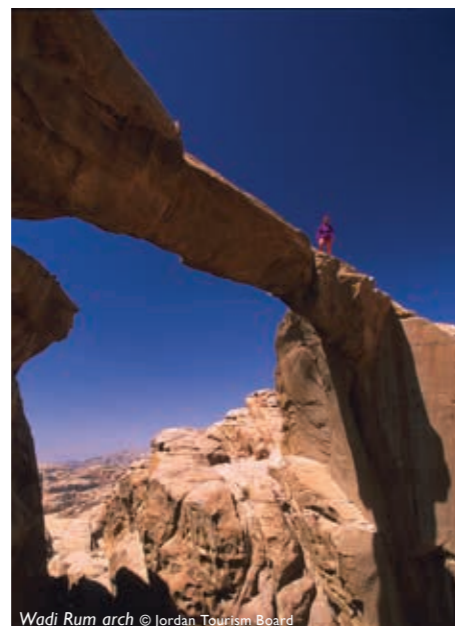
Wadi Rum arch

Day 2 Cairo Enjoy a full day tour of the Pyramids at Giza, with entry into the Great Pyramid of Khufu. Marvel at the mighty Sphinx and explore the ancient royal city of Memphis and the necropolis of Sakkara. BL