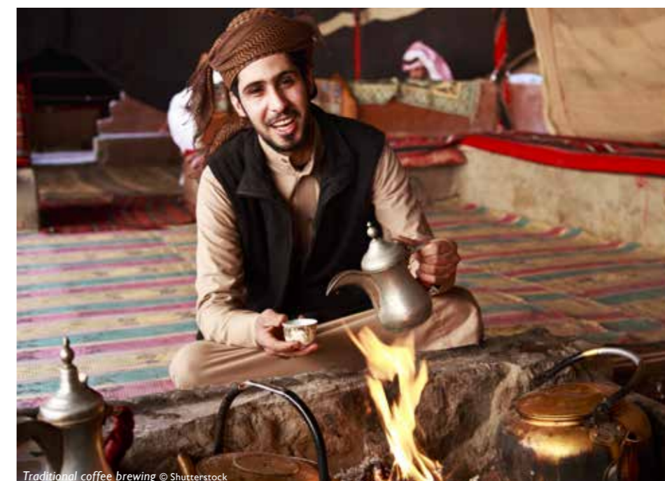
Traditional coffee brewing