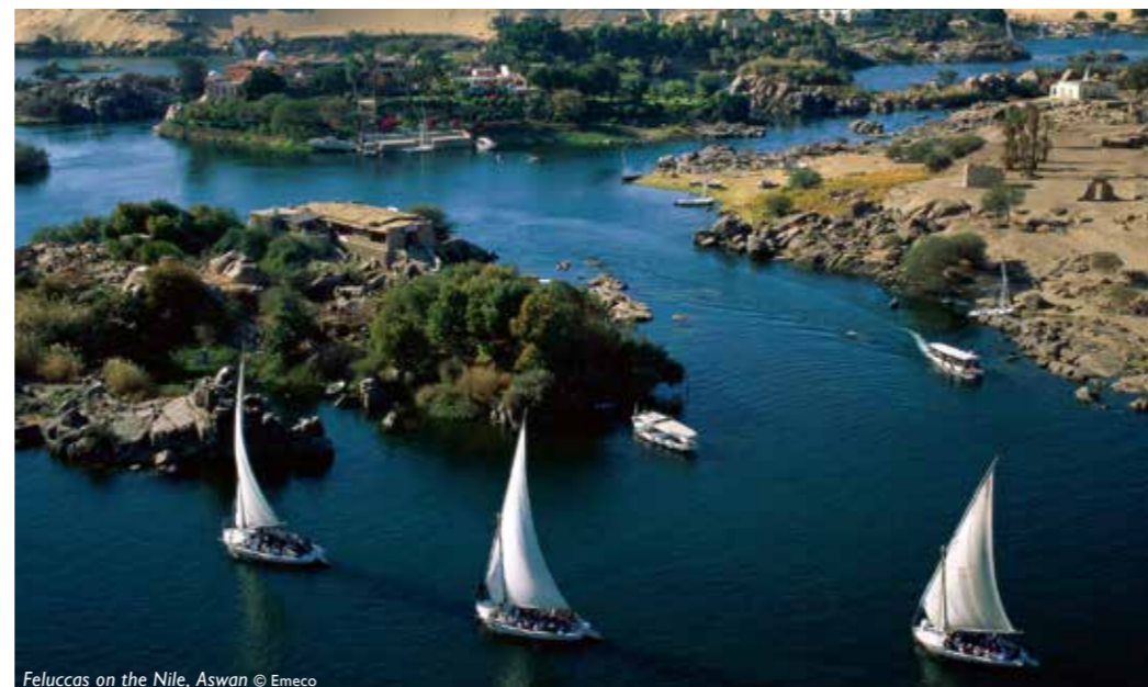
Feluccas on the Nile, Aswan

Days 11/12 Petra After breakfast depart via the King's Highway to Petra. On the way visit Madaba, home to the famous 6th century Mosaic Map of Jerusalem and the Holy Land. Continue to Mt Nebo, the mountain-top memorial of Moses and explore the famous crusader castle of Kerak. Next day enjoy a full day private tour of Petra, explore the ancient city and visit the famous Treasury carved into the rock face. Overnight at Mövenpick Resort Petra. B