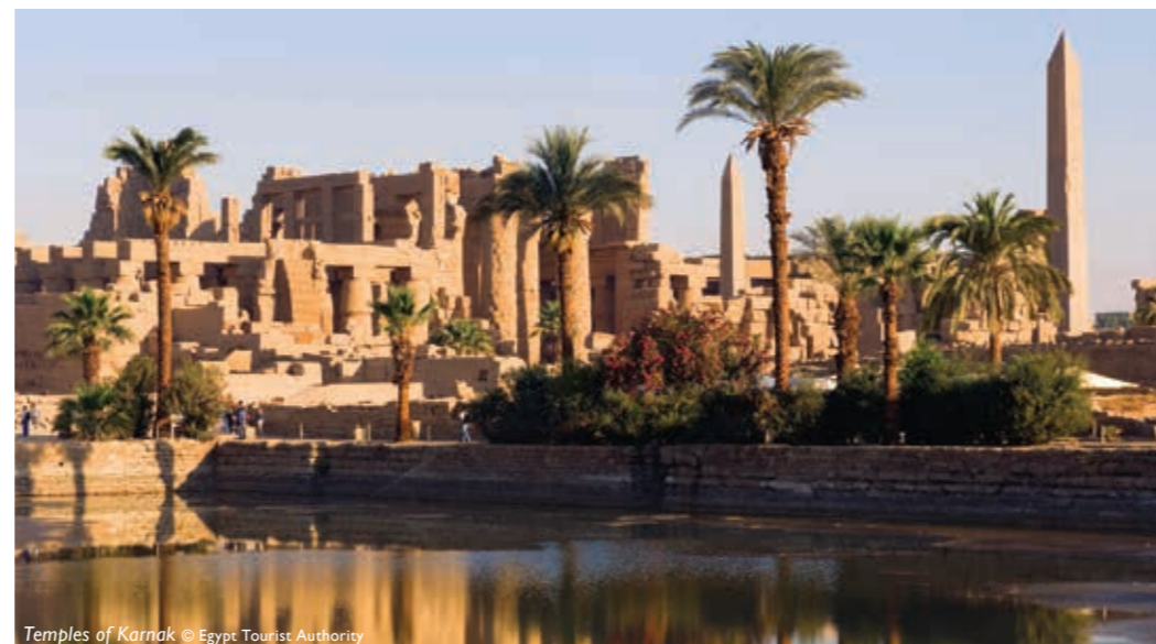
Temples of Karnak