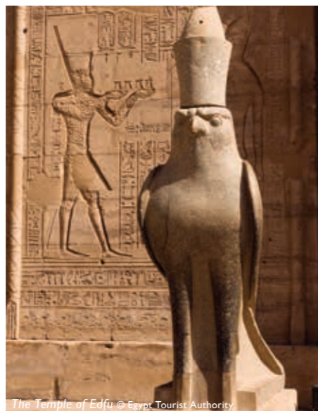
The Temple of Edfu