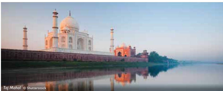
Taj Mahal