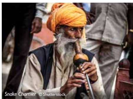
Snake Charmer

After breakfast, depart for Jaipur (7 hrs), visiting the Mughal ghost city of Fatehpur Sikri en route. Built in 1570, some historians believe this city was abandoned 15 years later due to a lack of water. On Day 5 enjoy a full day tour of Jaipur including the Amber Fort, Palace of Winds, Jantar Mantar observatory and the City Palace. B