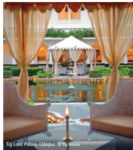
Taj Lake Palace, Udaipur